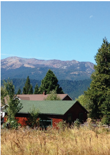
The Eddy Mountains from Sisson Meadow.

Community members, school children and visitors enjoy Sisson Meadow year round. We invite you to take a stroll and spend some time enjoying nature.