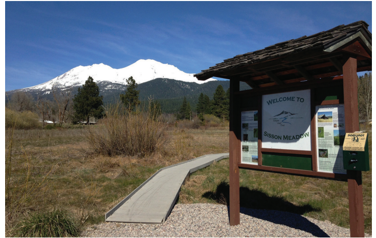
The main entrance of Sisson Meadow from Castle Street.

The restoration of Sisson Meadow began in 2003 after Siskiyou Land Trust purchased the property to protect it from development. Up until 1960, the meadow was